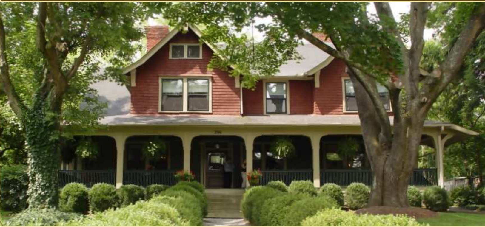
A Legendary Asheville Bed and Breakfast Inn